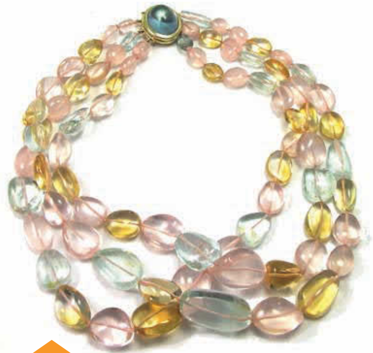
PASTEL PEBBLE CHOKER Citrine, topaz, rose quartz & aquamarine beads with oval cabochon aquamarine & 18k yellow gold clasp $24,500