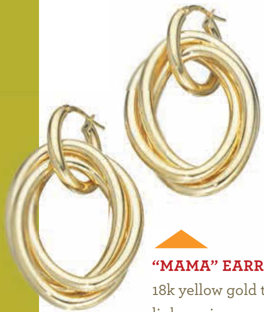
▲ "MAMA" EARRINGS 18k yellow gold twisted-link earrings, made in Italy $3,000

Six Designers on What's New & Fabulous in Jewelry