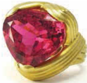
WRAPAROUND RIBBON COCKTAIL RING 16-carat rare pear-shape faceted rubelite, set in 18k yellow gold $18,900

The unique palette and flow of Frank Ancona's creations are the ideal complement to the muted colors and soft lines of Lanvin's sensational fall 2010 RTW collection.