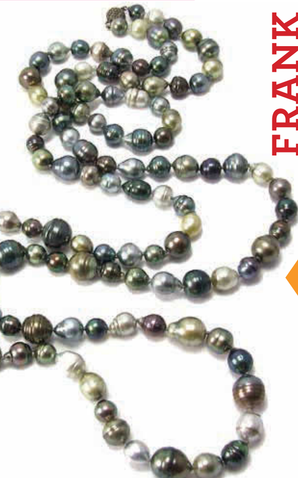
PEARL ROPE NECKLACE 52" of baroque natural multi-color Tahitian pearls $9,900