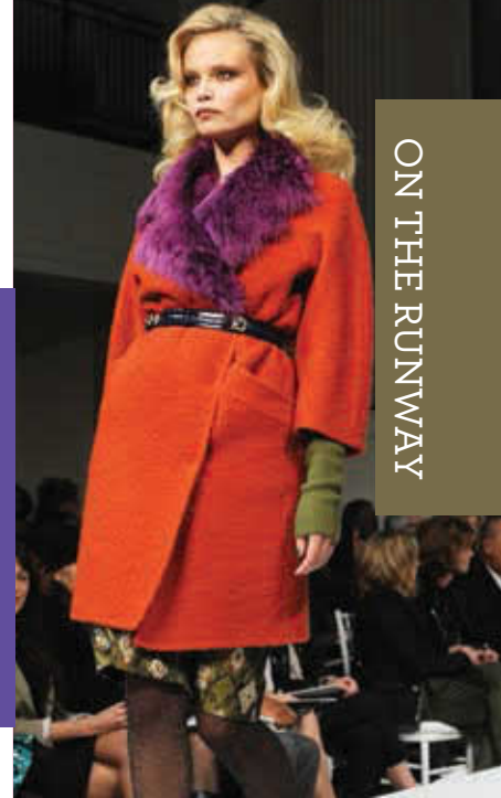
ON THE RUNWAY

“Timeless Oscar Heyman heirloom designs from an era when ladies weren’t afraid to be ladies...”