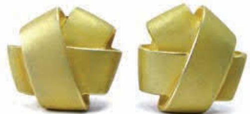
RIBBON KNOT EARRING 18k yellow gold $6,900